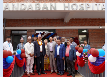
Breaking Barriers to Health with USAID ASHA in Nepal