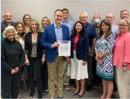
Signing the 2022 Kigali Declaration: Loving Our Neighbors