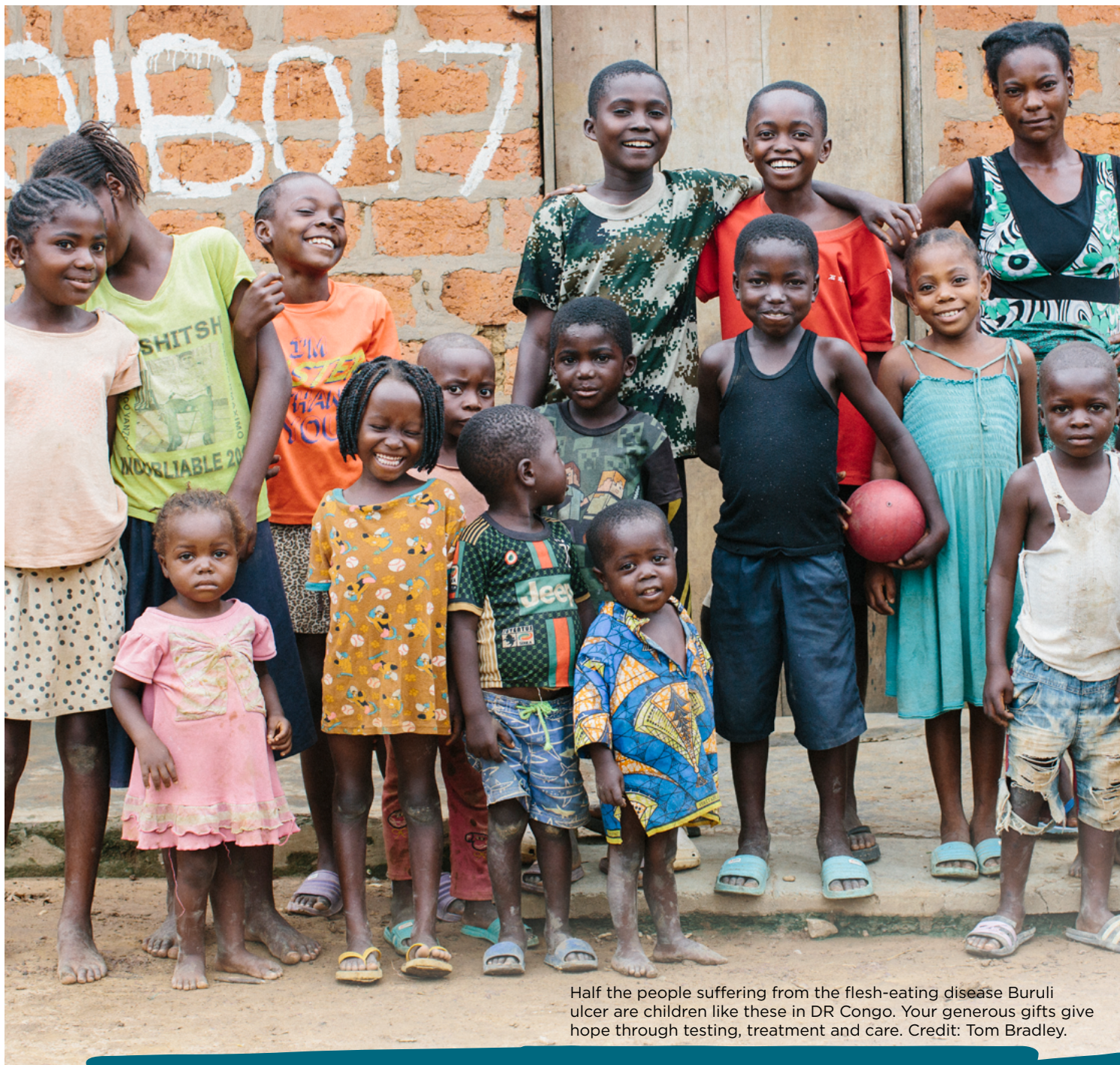
Half the people suffering from the flesh-eating disease Buruli ulcer are children like these in DR Congo. Your generous gifts give hope through testing, treatment and care.