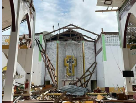
Surviving the Storm: Your Response to Typhoon Rai