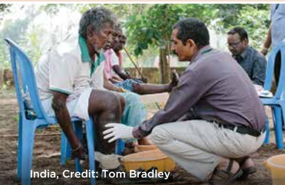
India