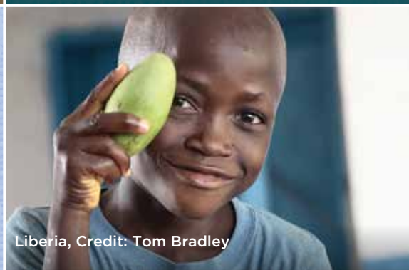
Liberia, Credit: Tom Bradley

health workers, leaders and others trained in NTD prevention and treatment