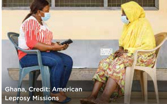
Ghana

Last year, generous people like you helped relieve suffering and restore hope to more than 200,000 men, women and children around the world.