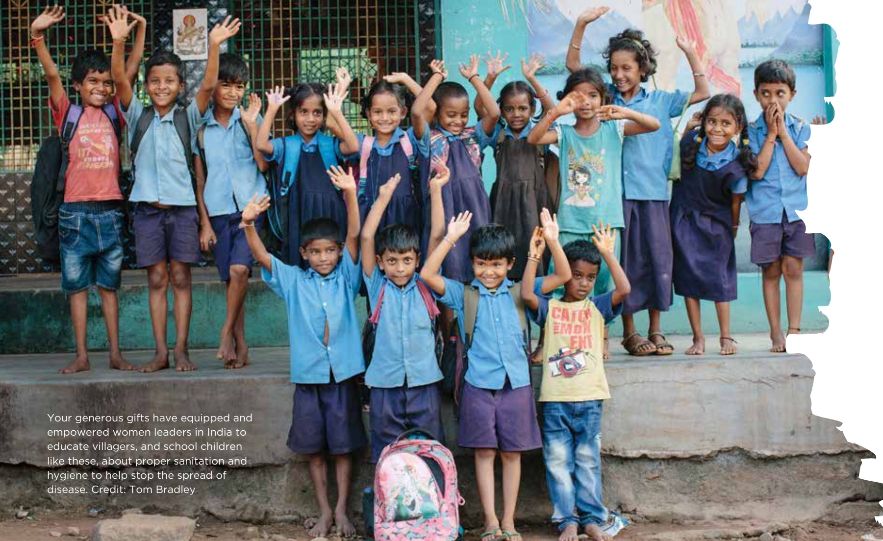
Your generous gifts have equipped and empowered women leaders in India to educate villagers, and school children like these, about proper sanitation and hygiene to help stop the spread of disease.