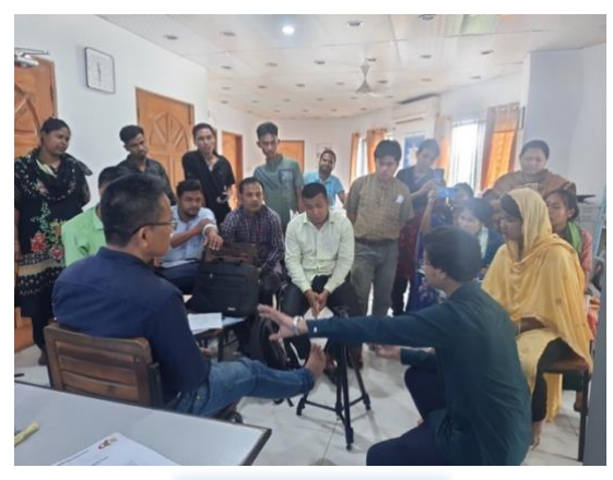
April 2023 Training

Scaling up pilot learning of digital leprosy complication care and follow-up in 20 districts across Bangladesh